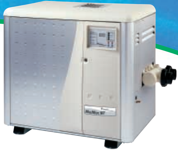
MiniMax NT heater required to heat pool in 24 hours